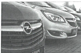
Fiat Chrysler Automobiles and Groupe PSA intend to merge operations, which includes PSA's Opel.