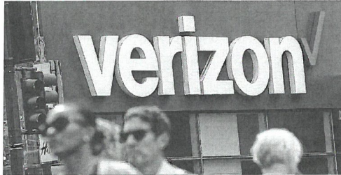
Verizon reported that there were 42,000 data breaches worldwide last year.

They include training employees in security principles, including how to handle and protect customer information and other vital data; keeping "clean machines" with the latest security software, web browser and operating system — the best defenses against viruses, malware and other online threats. Also, firewall security that prevents outsiders from accessing data on a